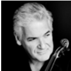
Pinchas Zukerman, conductor/violin

Vivaldi Concerto in B-Flat for Violin and Cello Couperin Pieces en Concert for Cello and String Orchestra Haydn Divertimento in D for Cello and String Orchestra Mozart Rondo in C for Violin and orchestra Schubert Symphony #5 in B-Flat