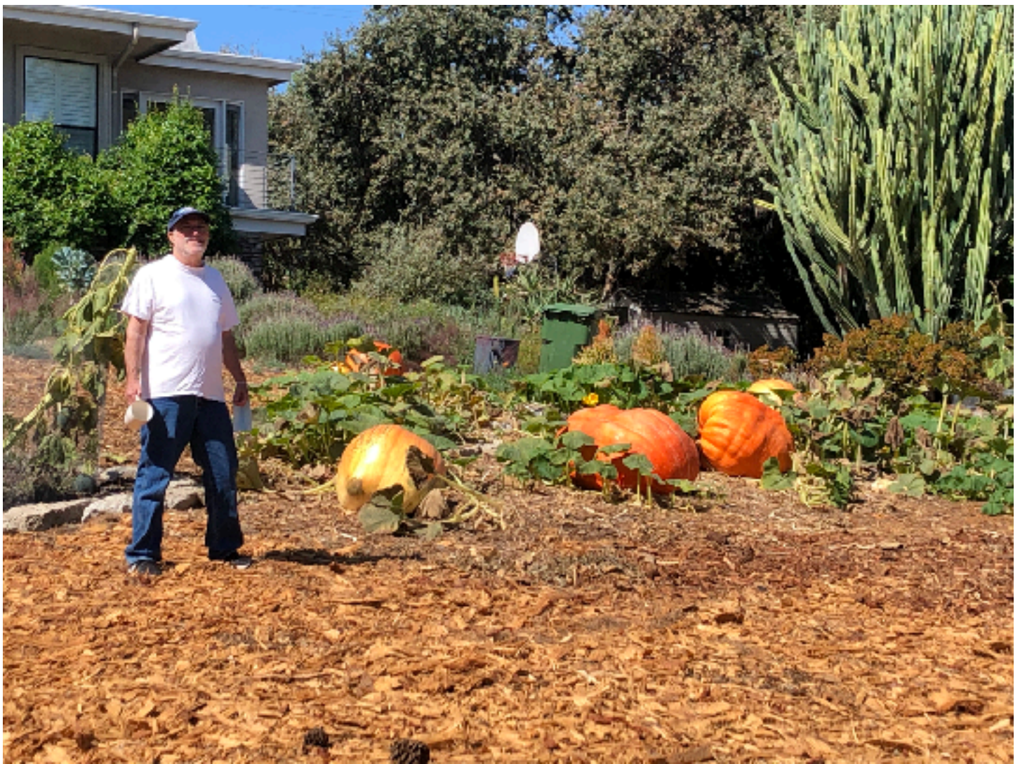
Thousand Oaks pumpkins. Happy October.